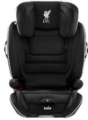
LFC Black Liverbird